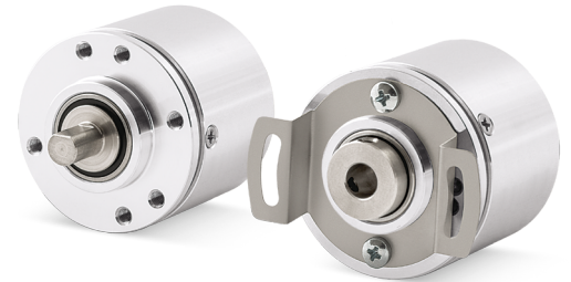
IQ36 • CKQ36